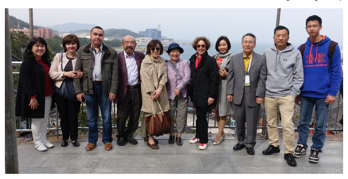
Sight seeing activity